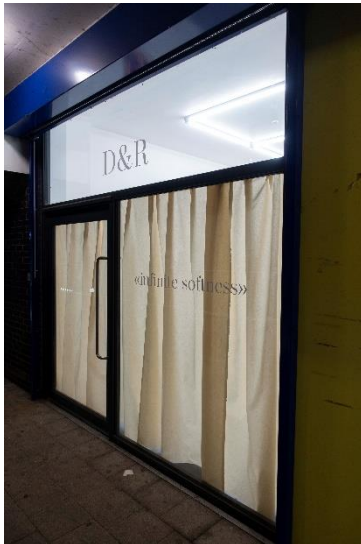
External view: Infinite Softness , 13 January - 29 January 2023. Danuser & Ramirez, London.

This seems to bode well with the foundational ethics of emerging gallery Danuser & Ramirez, which states an ambition to "grow from a substrate of cutting edge contemporary art discourse and love ethics". This is something I read and immediately could not ignore, mostly due to the fact that, from a decade of writing and engaging in said discourse, the statement seems to be something of a paradox. But in infinite softness, surely we must live in hope, and I am intrigued and invested in following how this ethos might manifest itself.