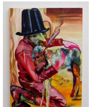
Yaya Yajie Liang, Clarice Starling , 2022. Acrylic on canvas. Danuser & Ramirez, London.

YaYa Yajie Liang's sole painting in the gallery is the first work encountered as you enter the space, yet initially it doesn't set the tone of softness. Through the painting 'Clarice Starling', we are asked to approach softness differently. While the palette of bright pinks, reds and browns is arguably more hyper-stimulating than any other work in the gallery, the scene unfolding on the canvas presents a rather tender relationship. The grotesque and the soft are hence shown together in perfect harmony, acting as a brutal force to challenge what 'softness' might mean. Less abandoning your responsibilities and heading to the woods, and more facing the things, and the people, that challenge you with an open softness. Without lazily falling into a liberal stance, perhaps that is what makes an infinite softness.